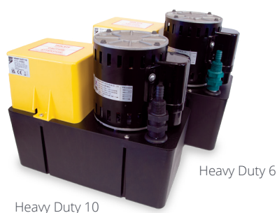
Heavy Duty 6